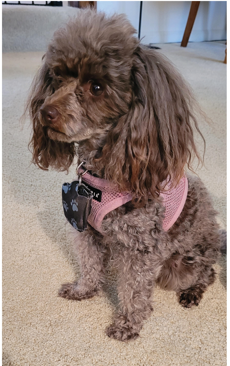
COSETTE THE WONDER DOG a 7 lb poodle has been know to defeat her elephant toy each morning.