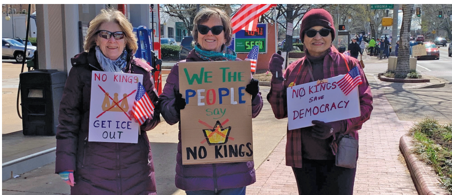
PICTURES WERE TAKEN from around the City of Falls Church, capturing scenes from across the community.